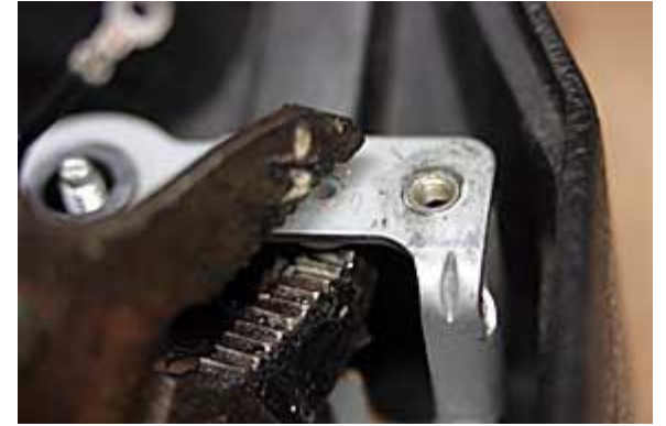
Use an adjustable pliers to squeeze the bushing all the way