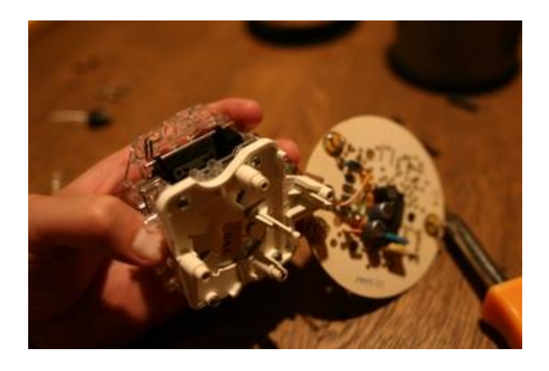
Remove the motor.