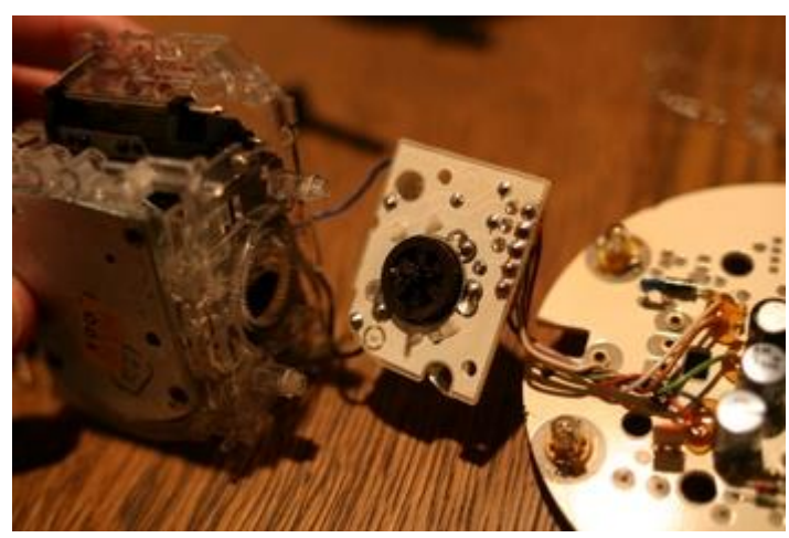
STEP 6: The guts

Once the motor comes out, you will get to the drive gear and pod. Inside the pod is going to be your broken gear. Replace it with your new gear.