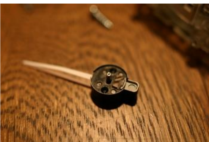
STEP 5: Disassembly

You've come this far, there is nothing stopping you now. Take the two screws out of the faceplate.