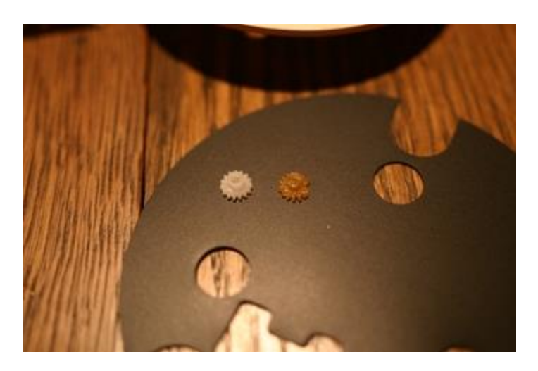
STEP 7: Reassembly

See the broken gear - and its yellow decay - compared to the new gear.