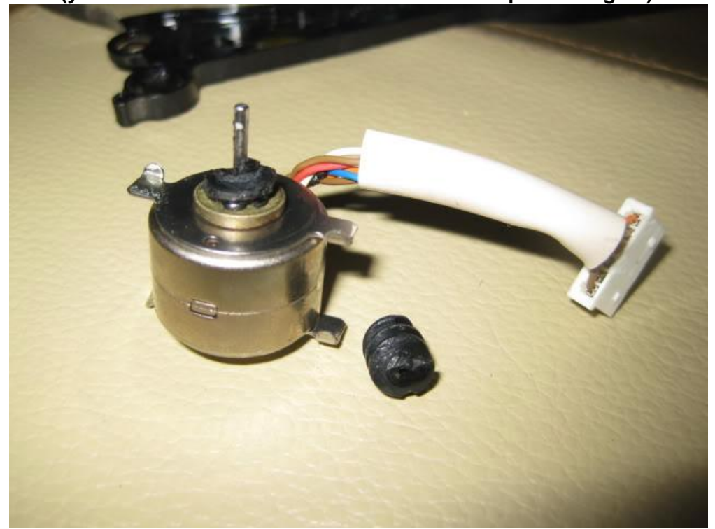
Once you get it out, you have this (you do not have to disconnect the cable to replace the gear)

On each side of the motor here you can see the clear plastic clip that holds it in. The motor has tabs on it that when you twist it, go under the plastic tabs. So to get the motor out, you have to push down on it and twist to get it out.